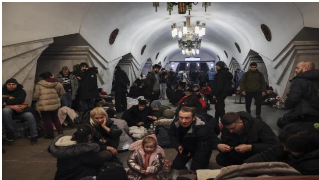
Ukrainians take refuge in an underground station in Kharkiv, which has been heavily damaged by Russian forces