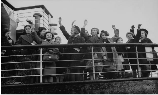
Thousands of Jewish children were evacuated from Germany and Austria before the outbreak of WW2

"The key thing I've learnt is the importance of social capital," he says. "Money and housing are important, but what is easy to overlook is that we all know how to go about trying to get a job here, or how the school system works. If you're arriving from overseas, you don't know any of that stuff, and that's how communities can really help."