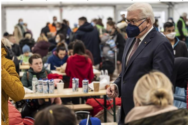
The German president Frank-Walter Steinmeier meets refugees from Ukraine