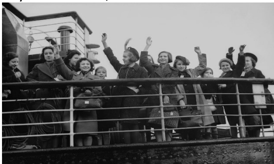
Thousands of Jewish children were evacuated from Germany and Austria before the outbreak of WW2

"The key thing I've learnt is the importance of social capital," he says. "Money and housing are important, but what is easy to overlook is that we all know how to go about trying to get a job here, or how the school system works. If you're arriving from overseas, you don't know any of that stuff, and that's how communities can really help."