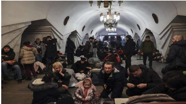
Ukrainians take refuge in an underground station in Kharkiv, which has been heavily damaged by Russian forces