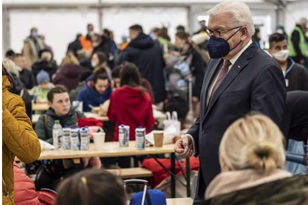
The German president Frank-Walter Steinmeier meets refugees from Ukraine