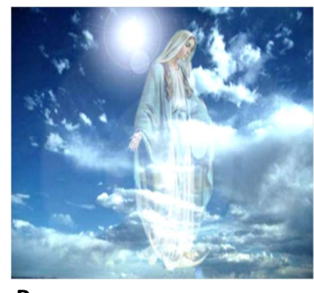
P salter Week 4

13<sup>th</sup> October 2024 Twenty-Eighth Sunday of the Year